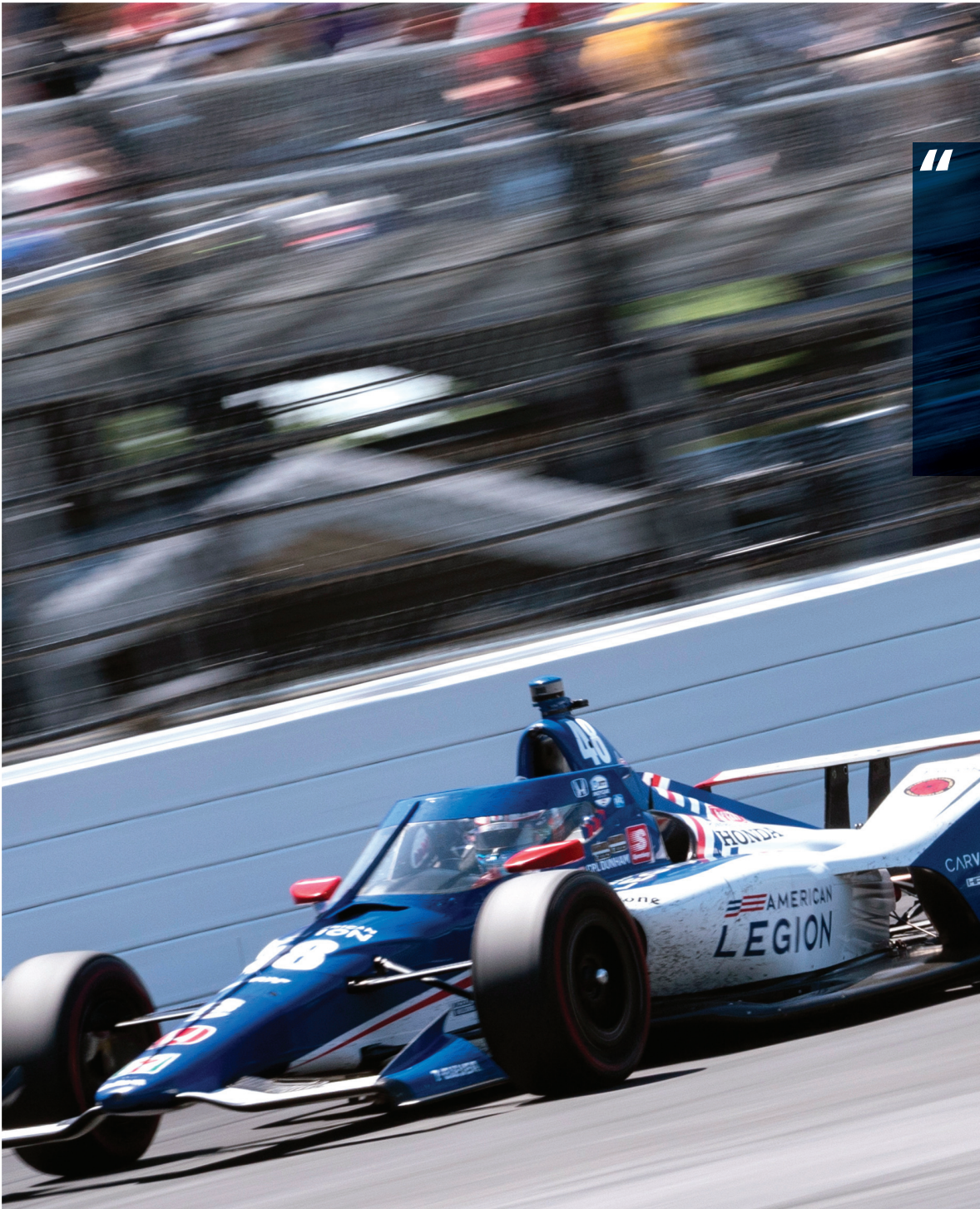
Tony Kanaan drives the No. 48 American Legion car in the 105th Indianapolis 500 in Indianapolis on May 30, 2021.