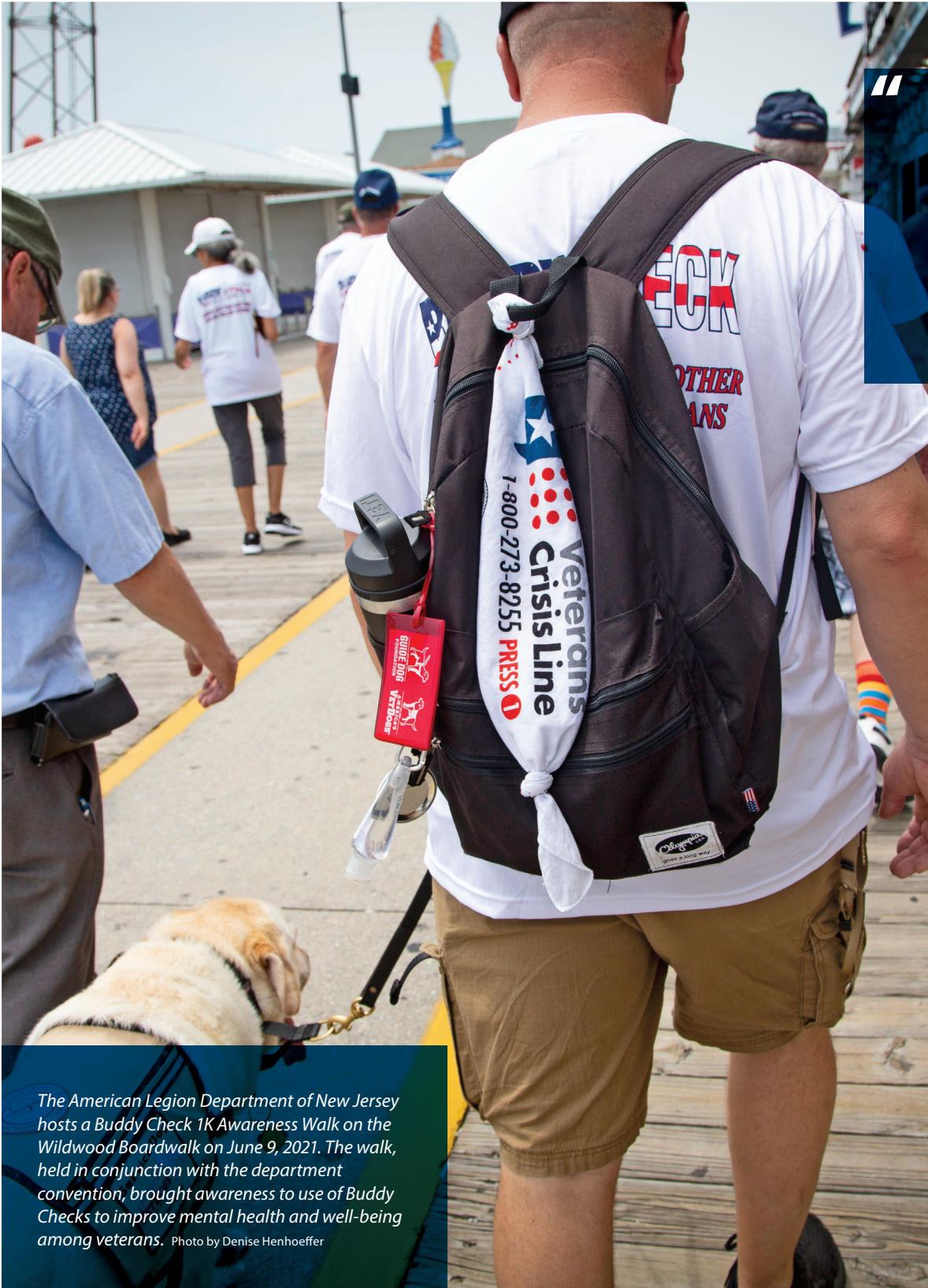
The American Legion Department of New Jersey hosts a Buddy Check 1K Awareness Walk on the Wildwood Boardwalk on June 9, 2021. The walk, held in conjunction with the department convention, brought awareness to use of Buddy Checks to improve mental health and well-being among veterans.