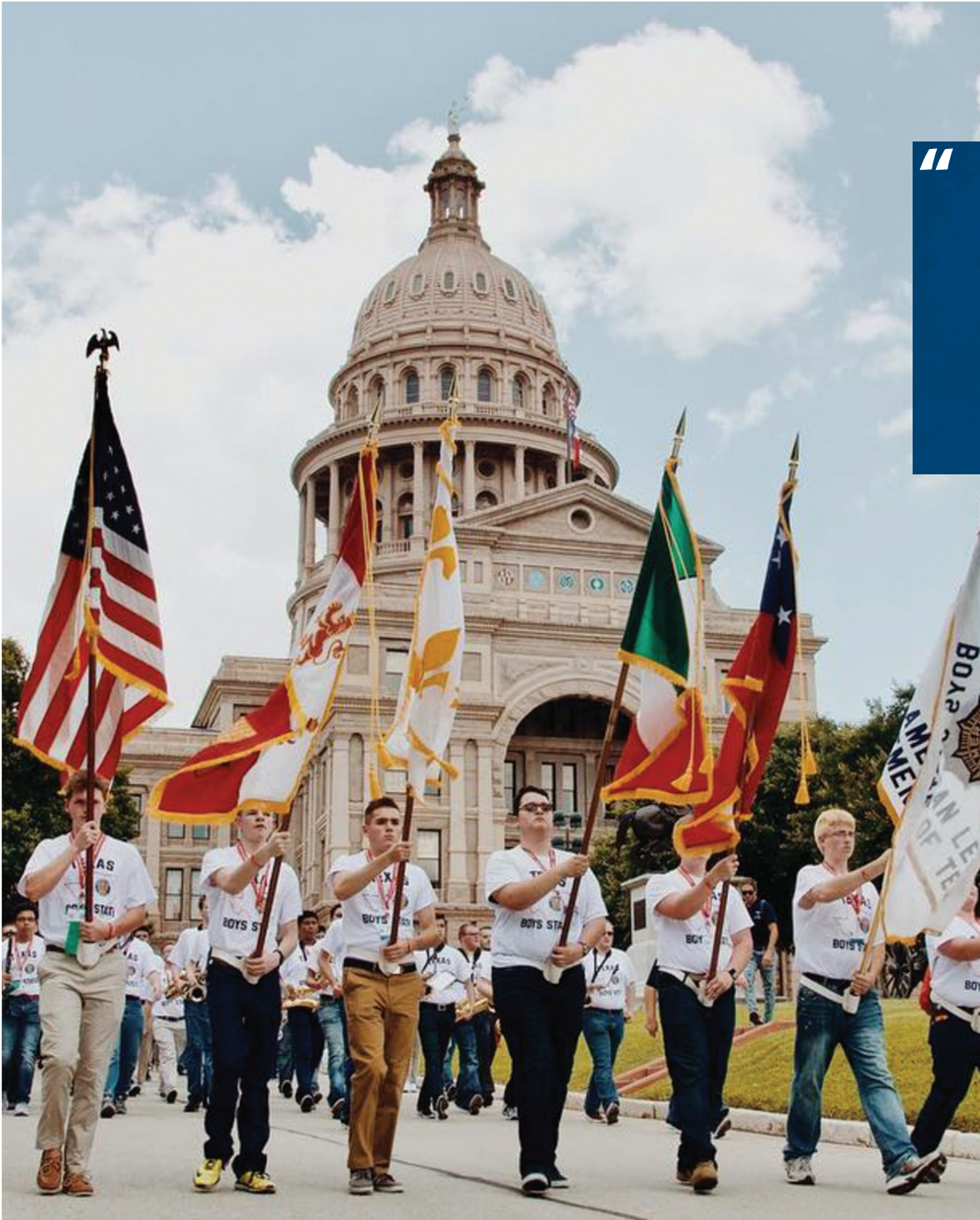
The more than 1,100 statesmen of Texas Boys State march to the Capitol in Austin on June 13, 2018.