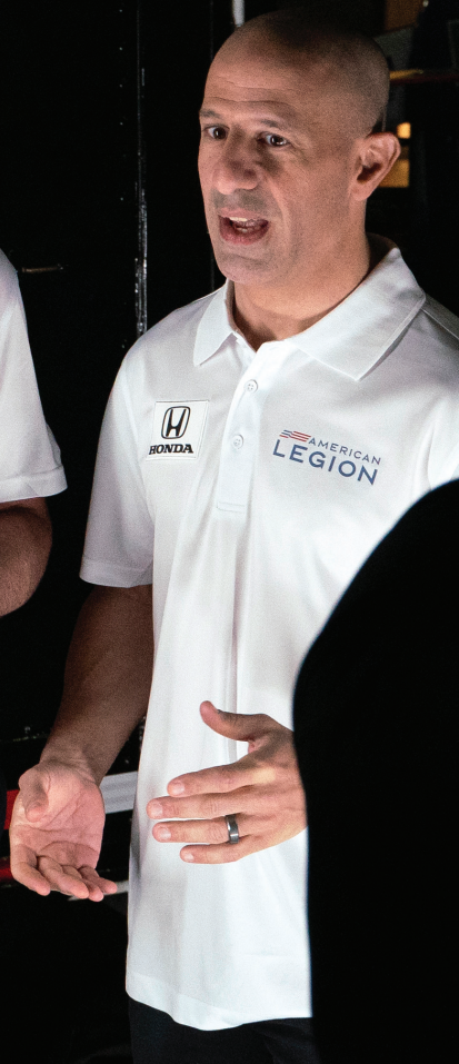
INDYCAR drivers Jimmie Johnson and Tony Kanaan produce TV messages about The American Legion at the Chip Ganassi Racing garage in Indianapolis in the days leading up to the Indianapolis 500.